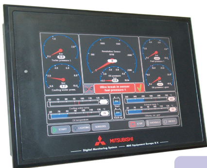
Touch screen panel

This new system is ready to be integrated in most ship management systems, by use of onboard Modbus communication or external connected profibus converter.